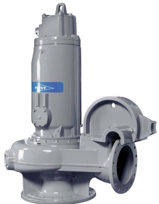
Flygt N 3400 Pump