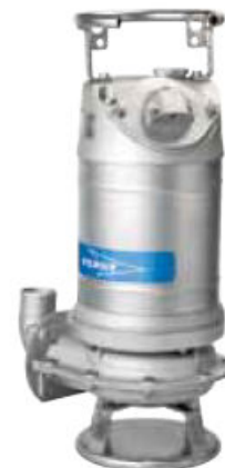
DS 2740 HT