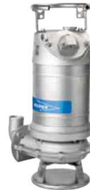
DS 2730 MT